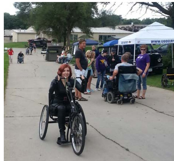
Pictures from 10th Annual Sports & Recreation Expo. More on the next page. Check out more pictures in our photo album on our Facebook page!